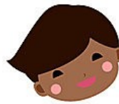
Year 2 Pupil

I receive daily physio whilst at school.