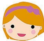
Year 4 Pupil

Yes. It's about when you need help and support. About when you struggle. They try to explain things. Sometimes you use resources like in maths, like bricks to count.