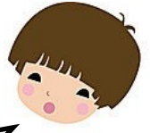
Year 5 Pupil

Tell me about what helps you to learn and do well.